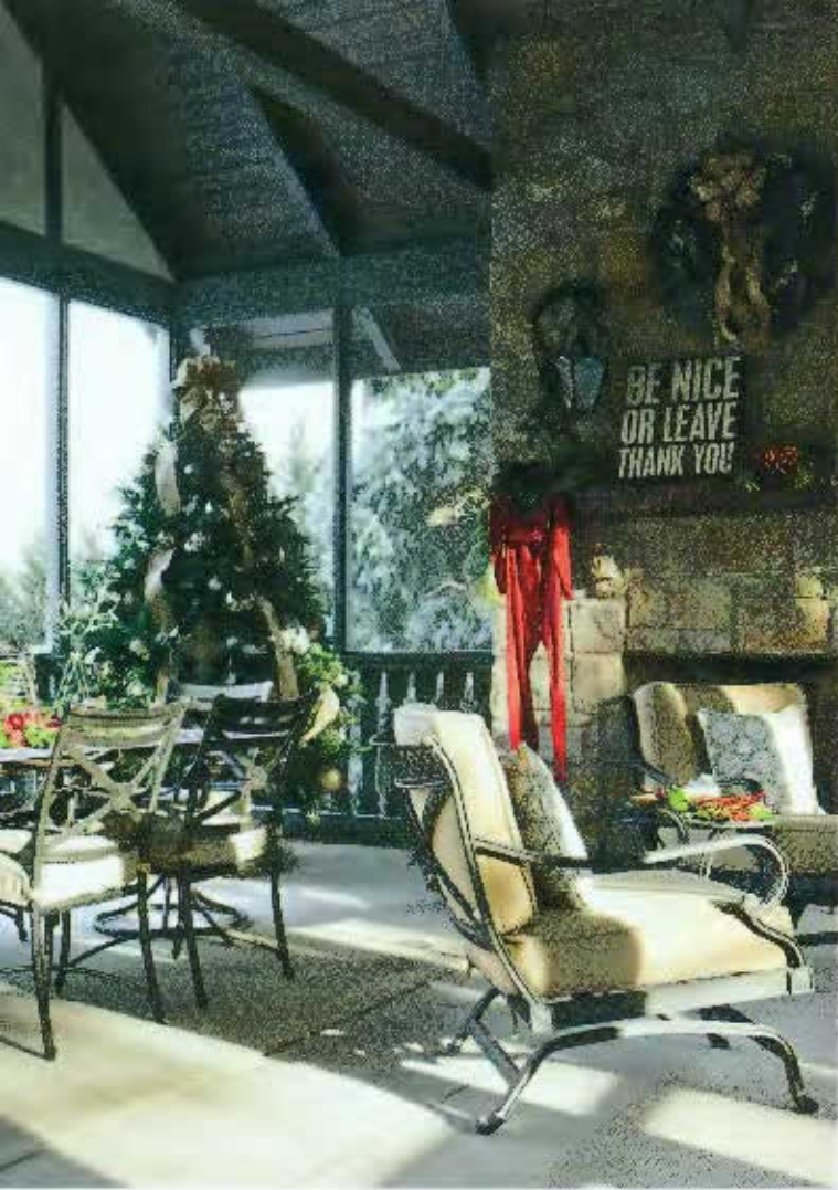
Above: A fireplace makes the screened-in porch usable almost every month of the year, so it gets longue-in-cheek decor too. Opposite: In the comfy, traditional living room, classic evergreen wreaths hang from the French doors that lead to the sunporch, announcing the ceiling-scraping tree that's laden with ornaments within.

gestooned the chandelier with peppercornies, vintage spoons and bells hung with ribbon.